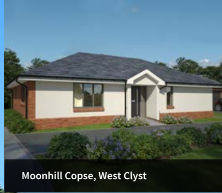
Moonhill Copse, West Clyst