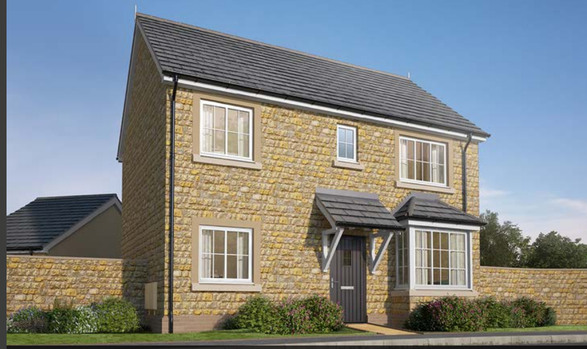
Computer generated image of 'The Helford', Venus Street