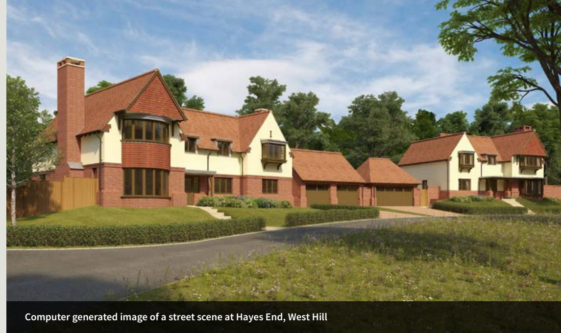
Computer generated image of a street scene at Hayes End, West Hill