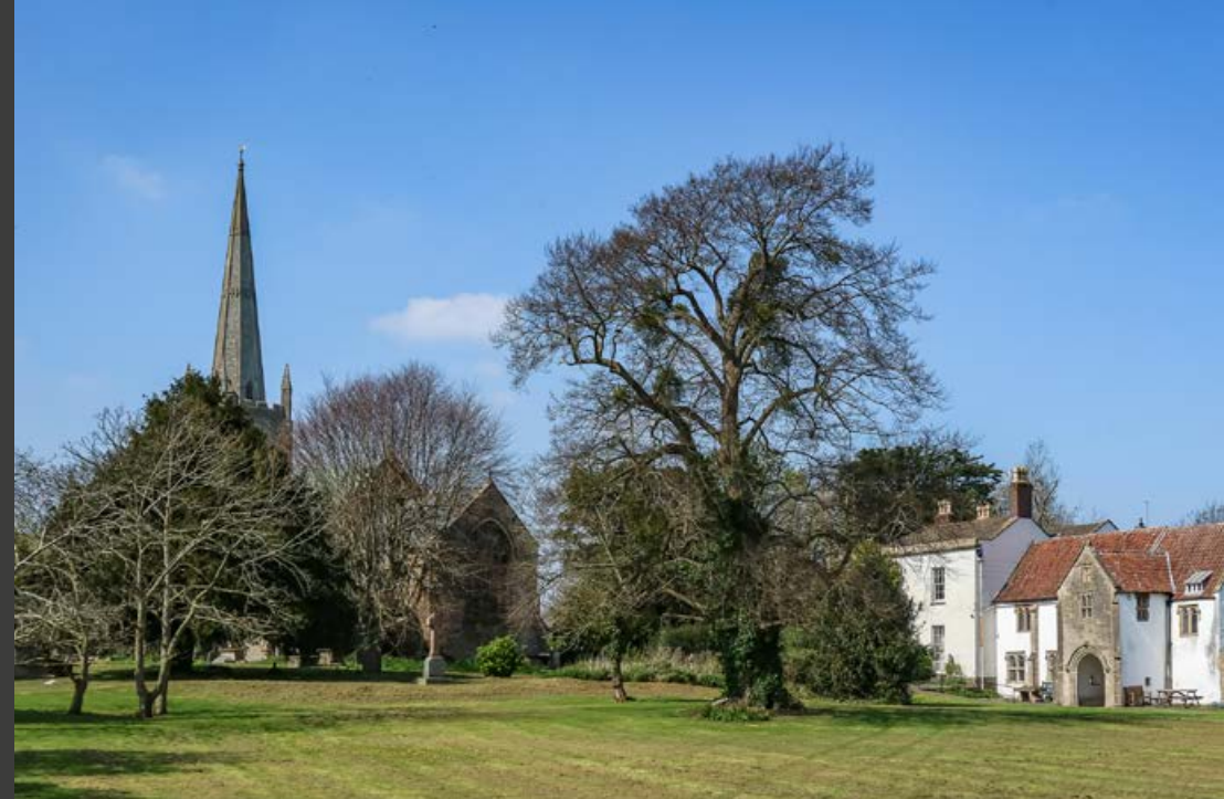
St Andrews Church, Congresbury