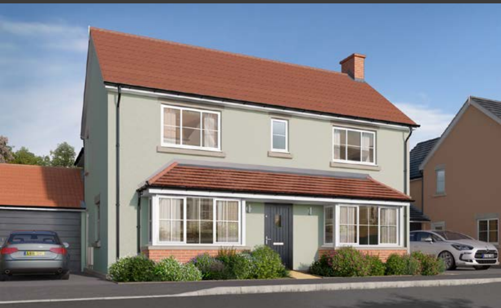
Computer generated image of 'The Dorchester', Venus Street