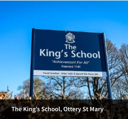
The King's School, Ottery St Mary

The East Devon Area of Outstanding Natural Beauty (AONB) landscape is characterised by intimate wooded combes, vast areas of heathland, fertile river valleys and breathtaking cliffs or hilltops. It includes the East Devon section of the Jurassic Coast – England’s first natural World Heritage Site – and is a living, working landscape shaped by many centuries of farming activity.