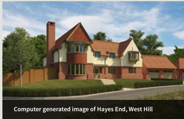
Computer generated image of Hayes End, West Hill