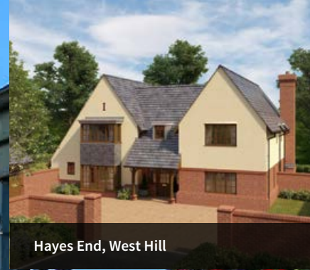
Hayes End, West Hill