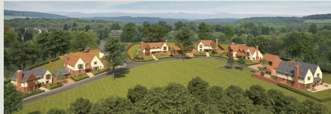
Computer generated image of Hayes End, West Hill