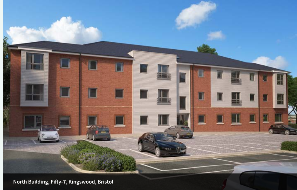
North Building, Fifty-7, Kingswood, Bristol