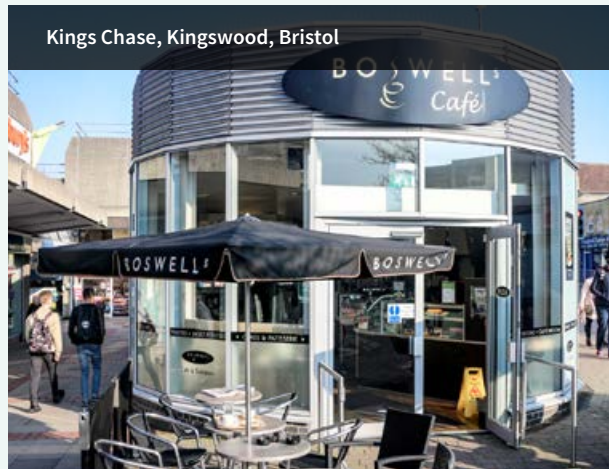
Kings Chase, Kingswood, Bristol