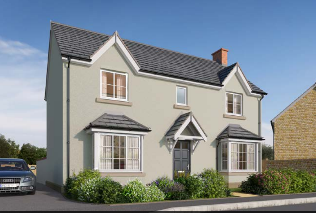
Computer generated image of 'The Thornton', Venus Street