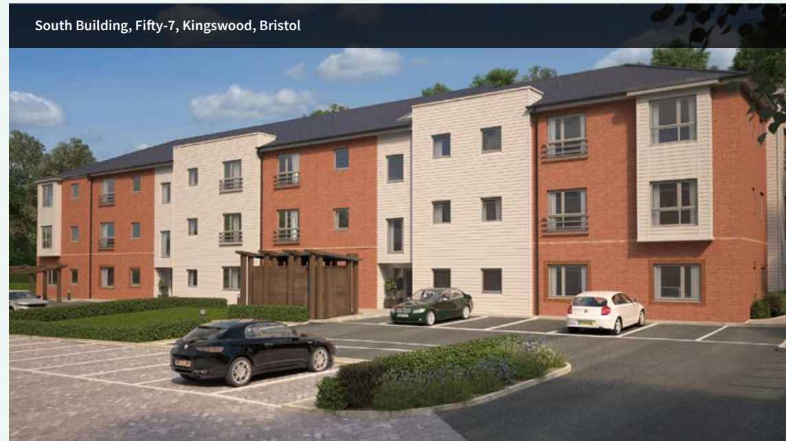
South Building, Fifty-7, Kingswood, Bristol