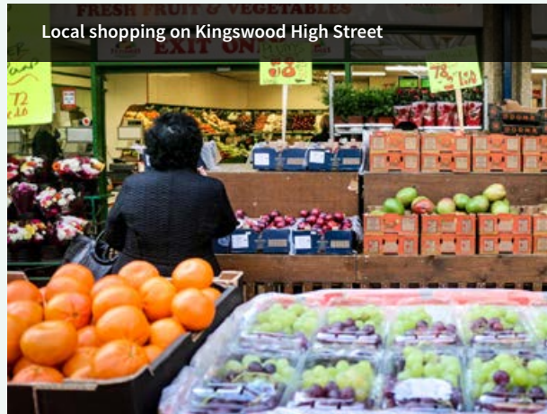
Local shopping on Kingswood High Street

Fifty-7 is our exciting new development of two apartment blocks totalling fifty-seven 1 and 2 bed apartments in Kingswood, Bristol.